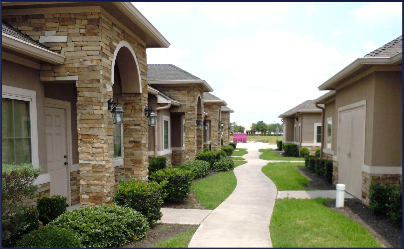
Interior Room Finishes